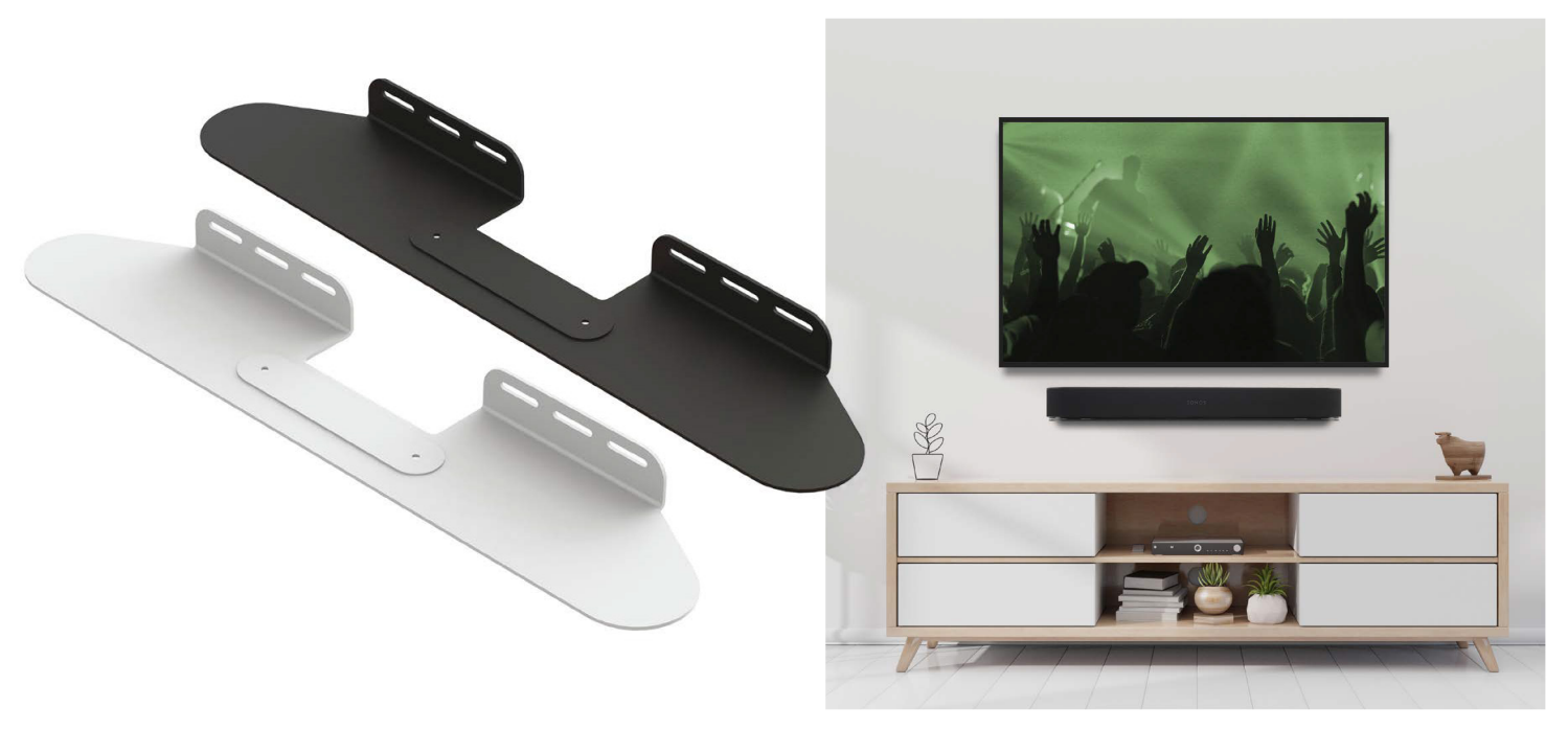
*Sonos is a registered trademark of Sonos Inc.Flexson is not affiliated with Sonos Inc.

Manufactured from steel and finished in either black or white this practical design will enable you to securely mount your Sonos Beam to your wall. There are two fixing points to make sure the Beam stays in place and plenty of access to route the cables you need.